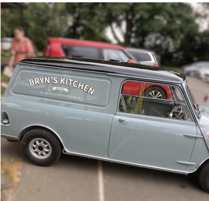
The van all ready to collect deliveries!