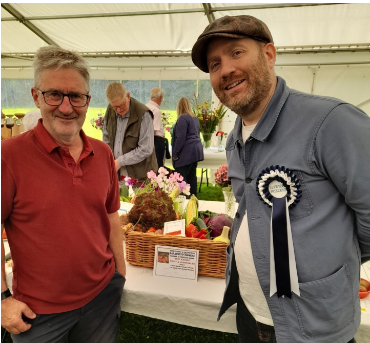
Is Bryn going to place a regular order for vegetables from Llandyrnog?