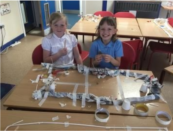
Designing and making a tabletop golf course

The juniors started off the term by designing and making mini marble crazy golf courses. They had to measure and create their own three-hole course, which they could play with their partner. They have also been investigating chemical reactions, including what causes the reaction that makes slime.