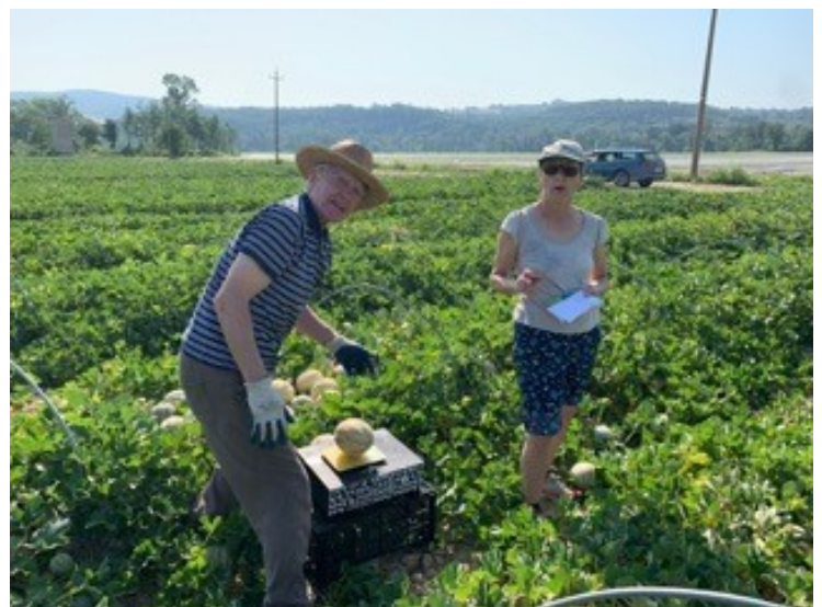
Picking melons at 34°C