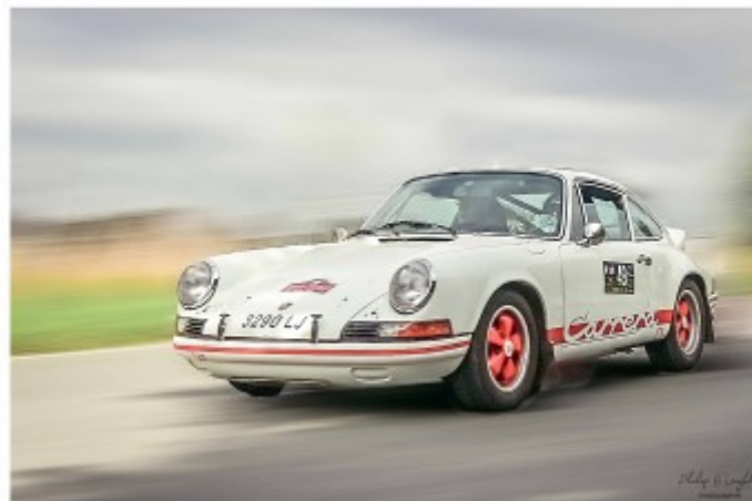
photo of a Porsche 911 from the rally

The Three Castles vintage car rally drove through the parish on a timed run from Denbigh to Nannerch.